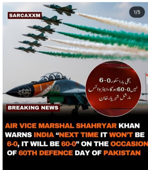
Figure 4: Likes = 17.2k , Comments= 295, Reposts= 72

This study uses qualitative content analysis to examine engagement metrics such as likes, reposts, and shares of political memes being shared on Instagram to assess their impact on political narratives.