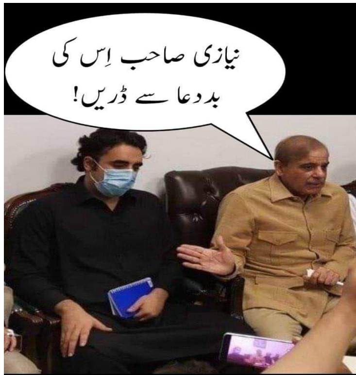
Figure 7: Refers to a political press conference