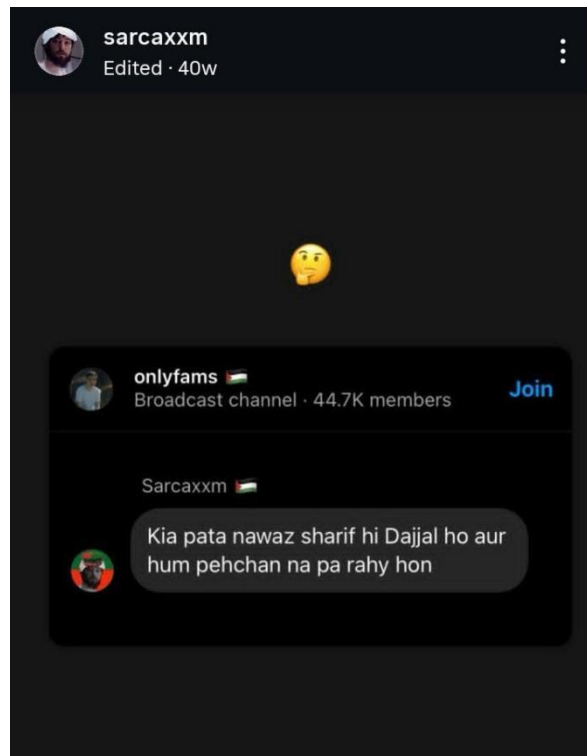
Figure 5: likes hidden, comments= 181, reposts= 1