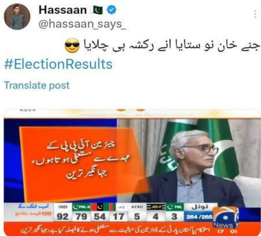
Figure 2: A political actor being preferred over the other on the basis of popularity among the general public.