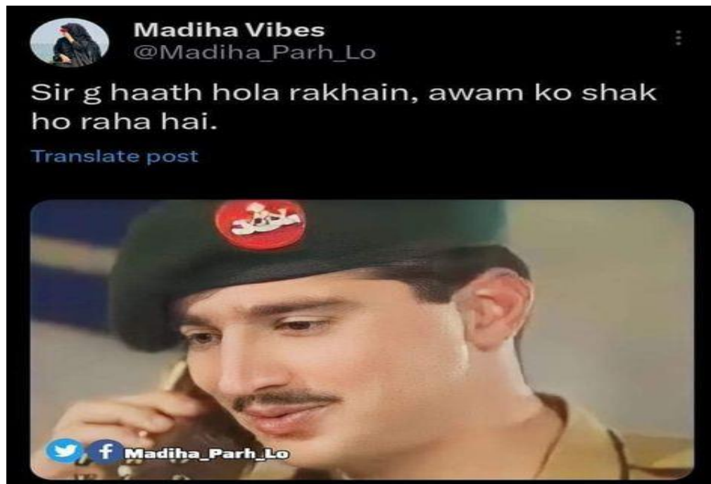
Figure 1: Refers to very recent (2024) political elections where one political party tried to blame on the “establishment” for being involved in government formation.